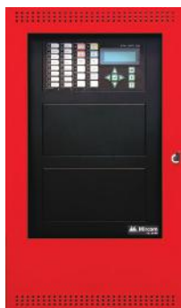
UB-1024DS with a DOX-1024DSR

Designed for peer-to-peer network communications, the various Flex-Net network panels allow for a maximum of 63 nodes, while providing reliability, flexibility and expandability.