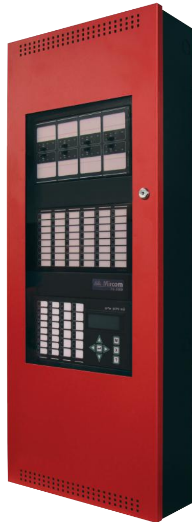
FX-2003-12NXTDS in a BBX-1024XTR enclosure (with optional DSPL-420-16TZDS Main Display module)

FleX-Net complies with the latest fire codes and standards, for control units (listed with UL 864, 9th Edition and ULC S527) and installation (NFPA, ULC S524). FM certified.