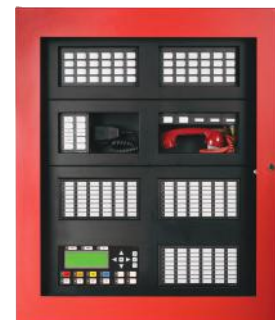
BB-5008 with a DOX-5008MR